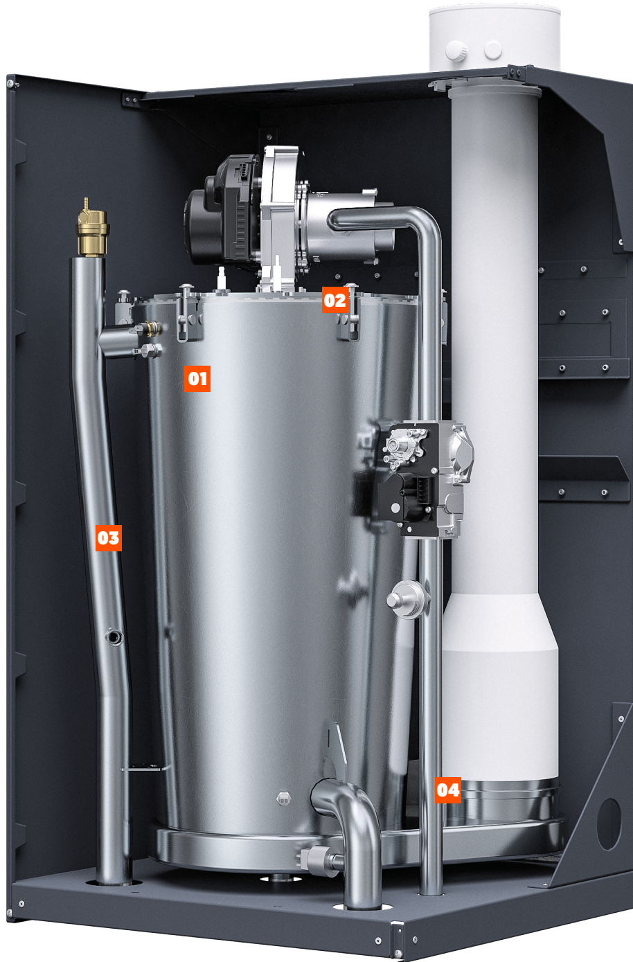
01 Stainless steel Fire Tube heat exchanger